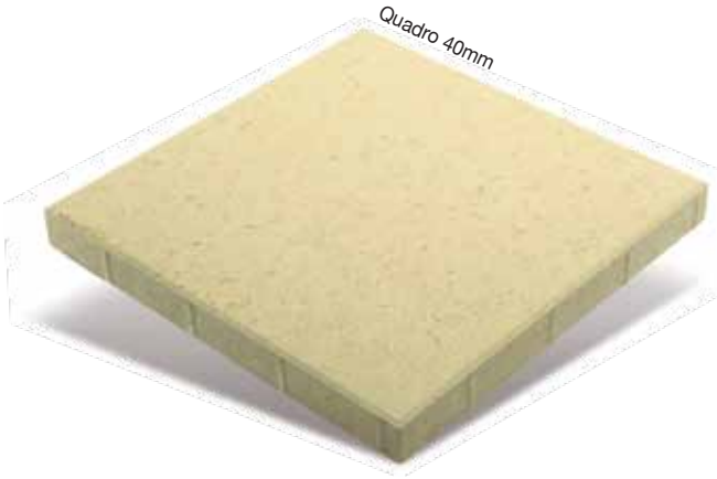
Quadro Only Available in 40mm